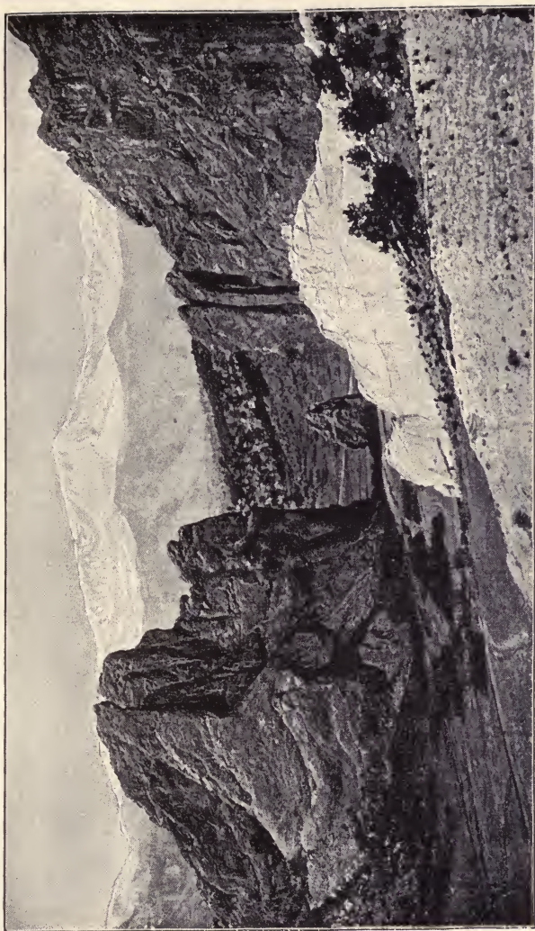
GATEWAY, GARDEN OF THE GODS.